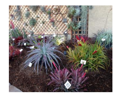
Detail of the 2016 fair display

We need a few volunteers to work on this fun project and maybe win a prize for SDBS again. Please stay for brief meeting after the March 11 meeting for an "ideas" meeting. The fair display will be in the same area as last vear but the theme is "HOW THE WEST WAS FUN" and the display must have some props or backdrop to incorporate the theme. Ideas so far: gold mining, boots, cow skulls, saddle, bar... These are ok props, but how can we make it fun or funny? Bring your ideas, the wackier the better! Meet no more than 1/2 hr.