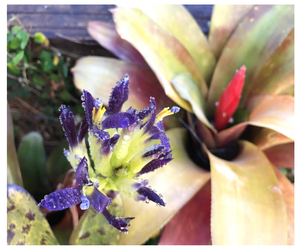
from Juliana Raposo's garden: Above, Aechmea kertesziae inflorescences brighten up the landscape; detail of spike on the right. Below, Billbergia brimstone has unusual indigo petals. Sister plant is showing a budding flower spike in the background.