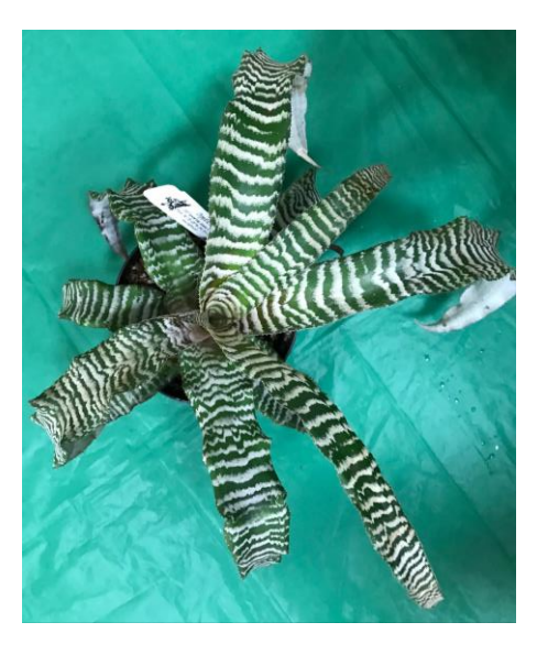
Crypto 'Very Cold Tooth'