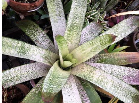
from Scott Sandel's collection: a billbergia ready to bloom and two colorful vrieseas